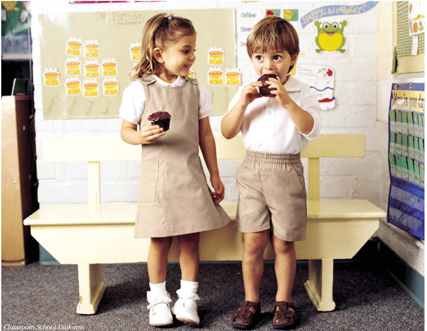
Classroom School Uniforms

With several states starting school years earlier than the traditional after-Labor-Day date, some as early as July, pressure from parents has pushed for legislation to limit how early school may begin. School boards are resisting, trying to maintain local control of their calendars and create more time to prepare students before state-mandated testing occurs. The tourism industry at large has joined the push for a change to later start dates citing lost income and a lack of student workers after school starts.