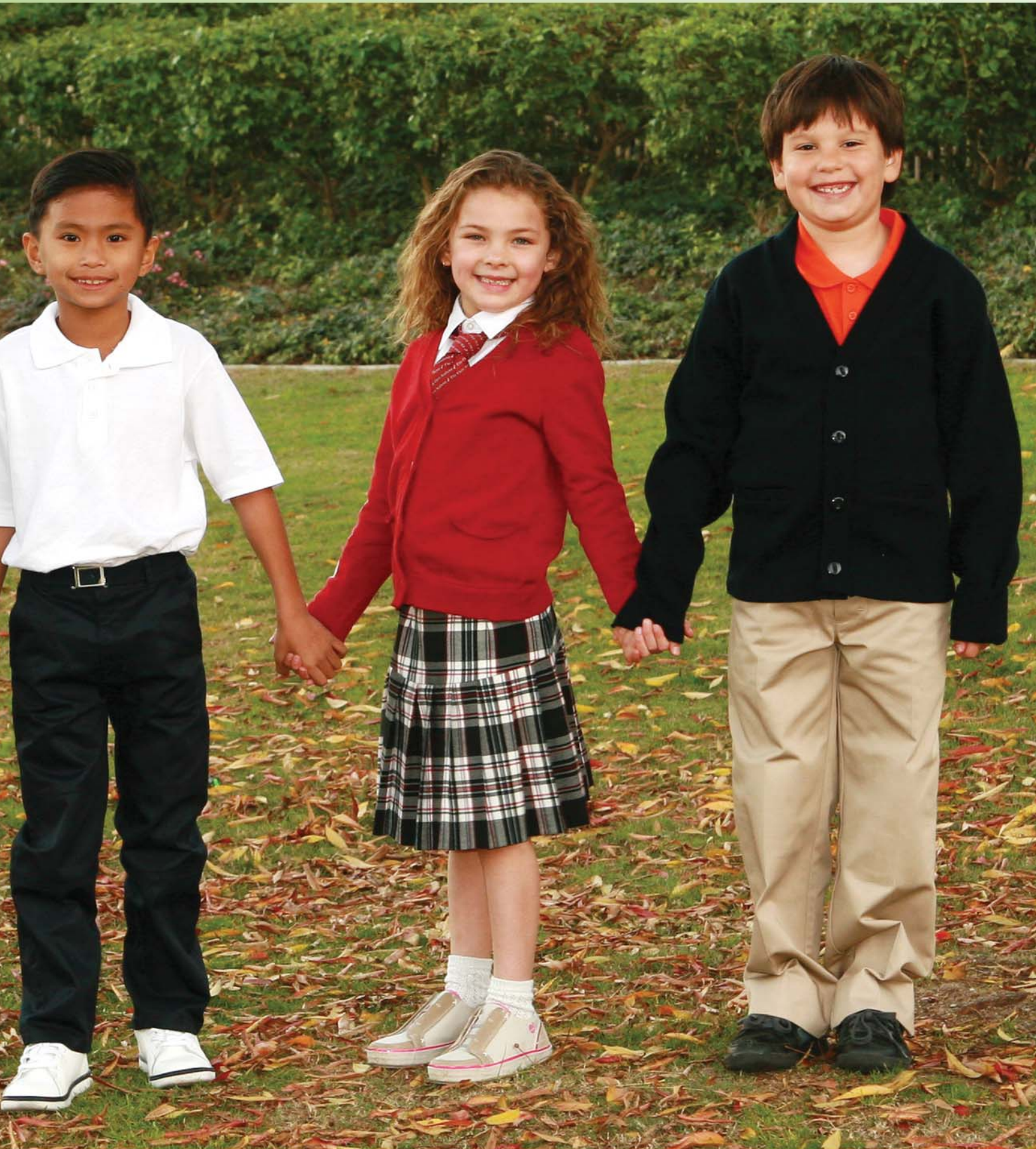
From left to right: Outfit by French Toast tights by Country Kids, Outfit by Carter's "Watch the Wear" shoes by Polo Outfit by Create Your Uniform shoes by Timberland, Outfit by Classroom School Uniform

Jj Kk Ll Mm Nn Oo Pp Qq Rr Ss Tt Uu Vv Ww Xx Yy Zz